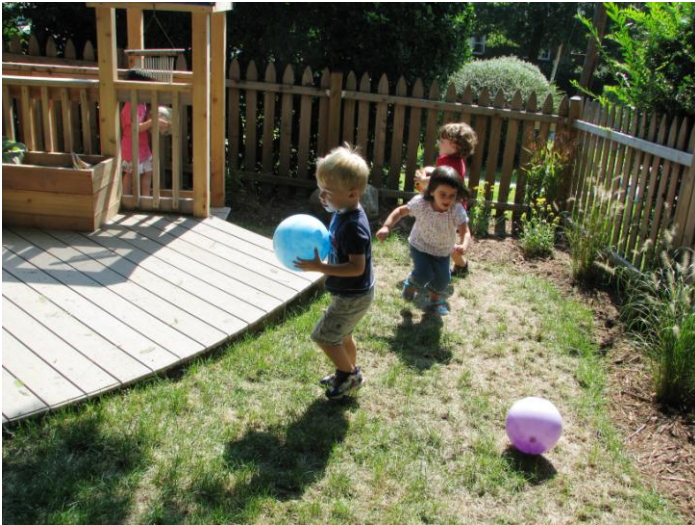
Ball playing in our garden