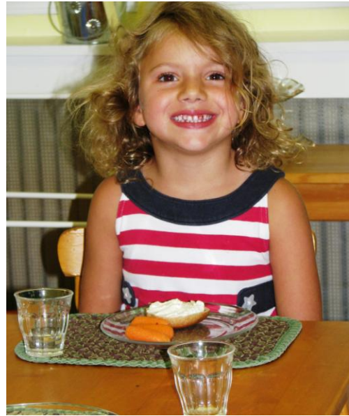
Having a healthy snack