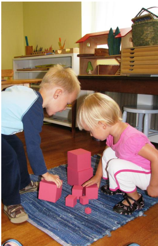
Building the Pink Tower