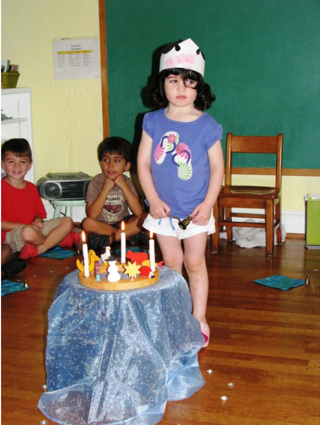
A birthday celebration