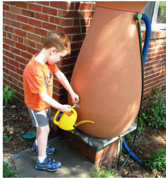
Refilling his watering can