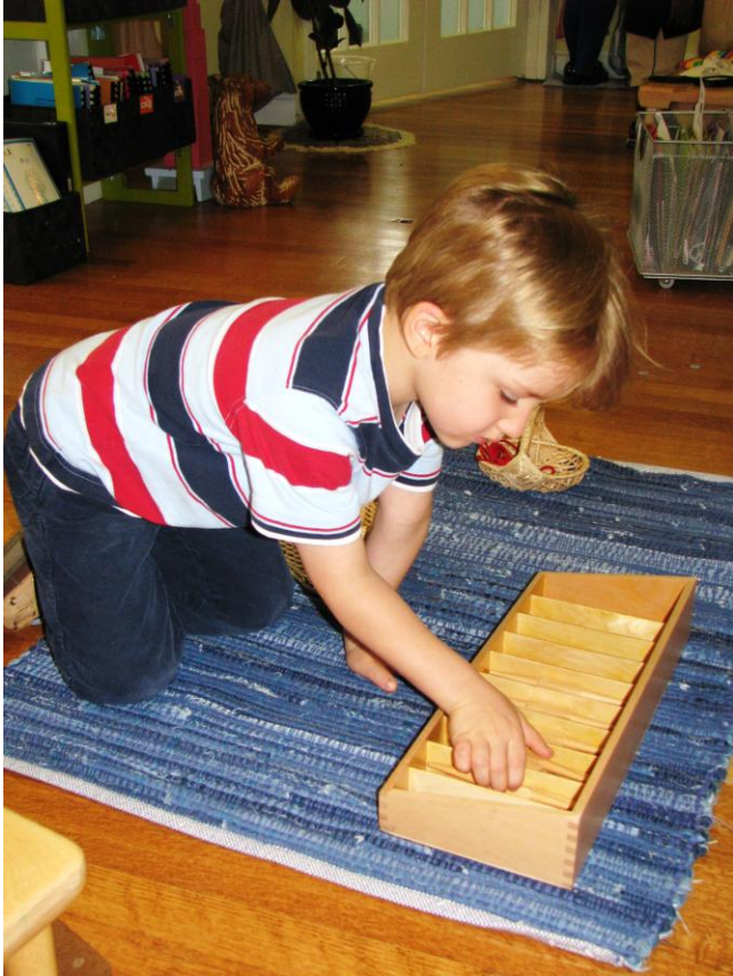
Spindle Box work