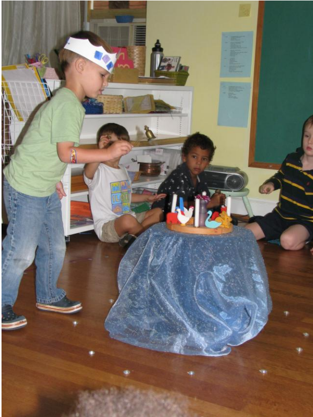
Snuffing out his birthday candles