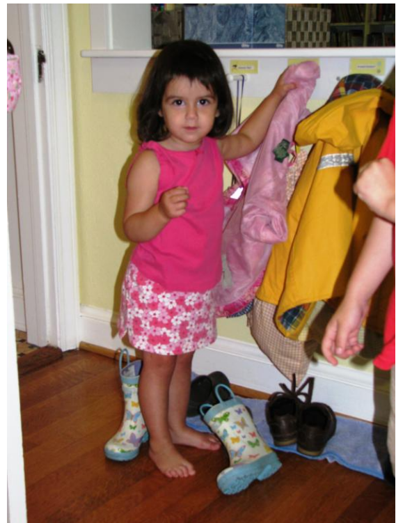
Hanging her jacket