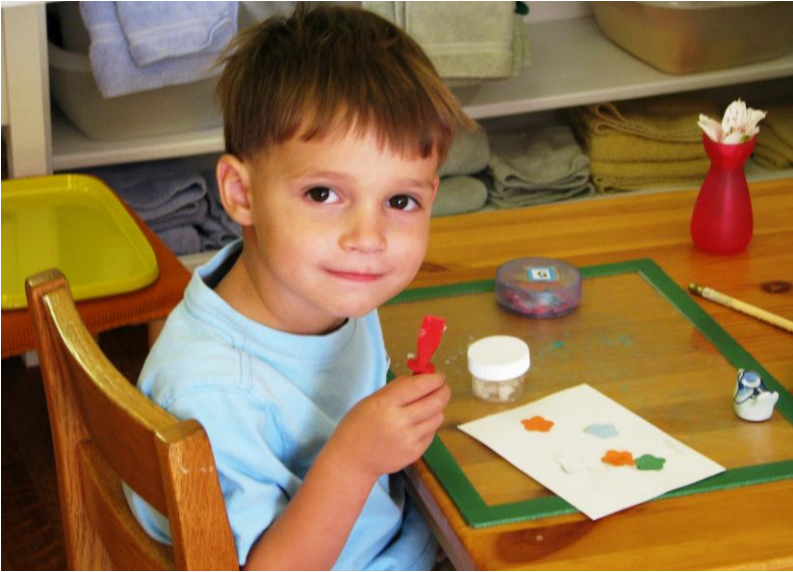
A pasting activity