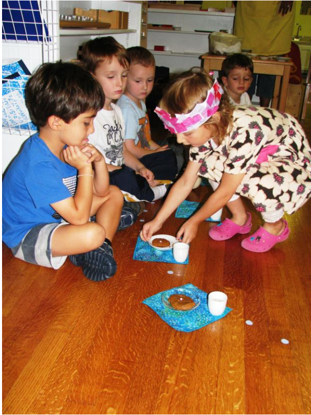
Serving cookies during her birthday celebration