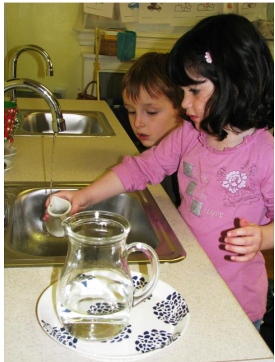
Refilling a pitcher for pouring activity