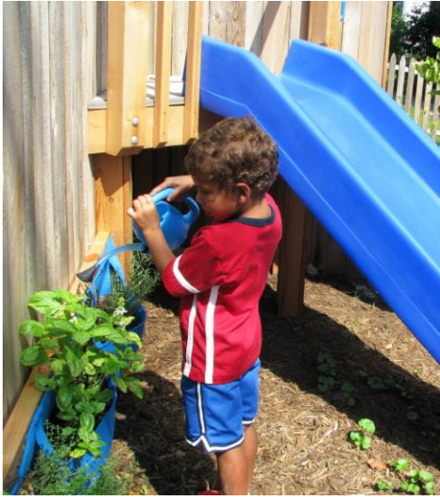
Watering our herbs