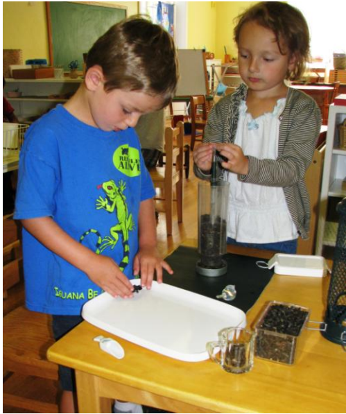
Feeding the outside birds