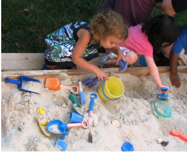
Playing cooperatively in sandbox