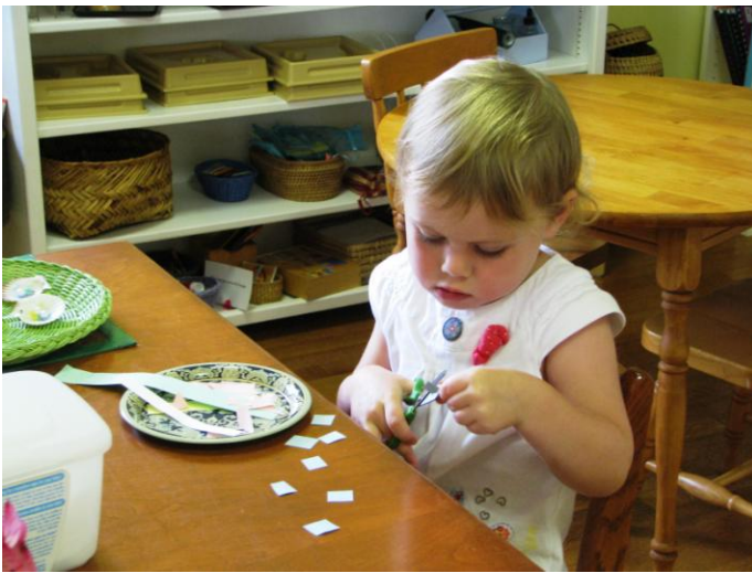
Scissor cutting – strips of paper