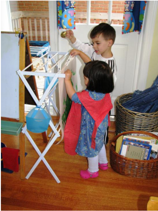
Older child helping younger child hang up painting